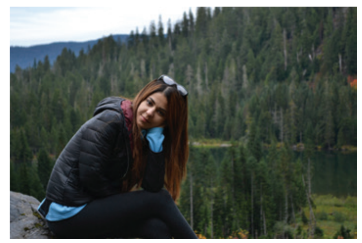
Did you stay in touch with your classmates, and, if so, how often do you see them?

Since KIMEP has a large international community, I got used to intercultural interaction, so I am comfortable now when it comes to interviewing people with different backgrounds and nationalities.