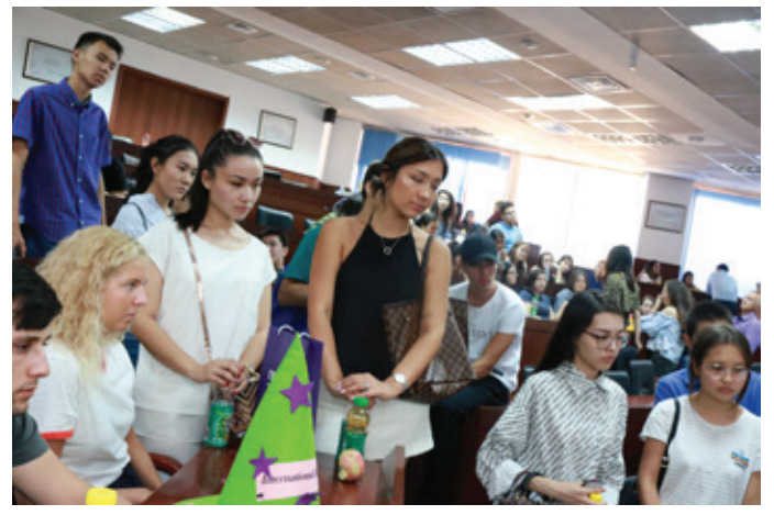
Freshmen at the CSS Freshman Day event in August 2018.

The CSS session at the Freshman Orientation Day in August 2018 resulted in lively discussions between incoming students, senior students and faculty members.