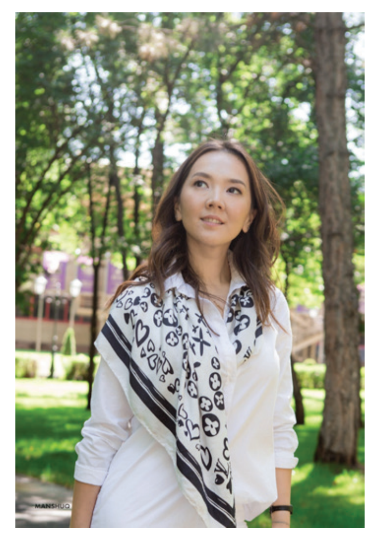
«Almaty is the city of opportunities»

So, I took the most direct part in organizing the Universiade. The most important experience that I gained from this project was that, by being industrious and stubborn, you can succeed even if you are young and don't have any connections. Therefore, I always say: if you really work – you will definitely be noticed and supported.